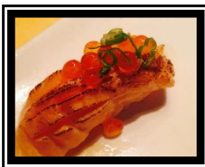
Seared Salmon Belly