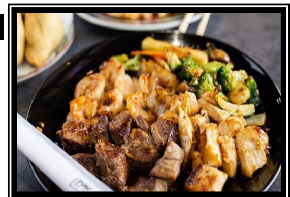
Habachi Chicken & Steak