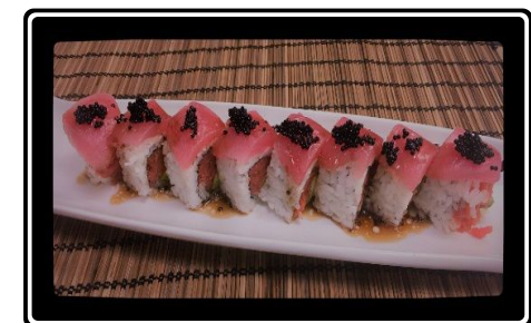
Red Dragon Roll