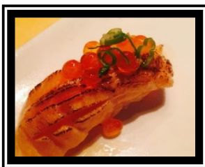
Seared Salmon Belly