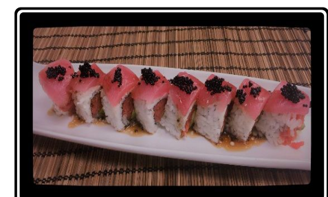
Red Dragon Roll