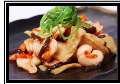
Ika Sansai Salad