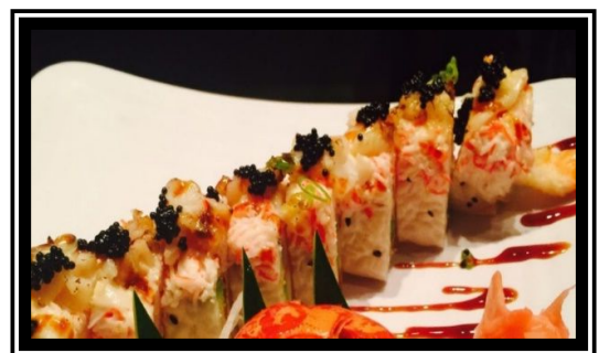
Lobster Fantasy Roll