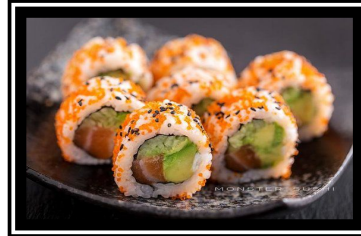
Salmon California Roll