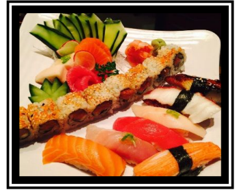
Sushi & Sashimi Combo