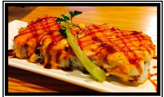
Bake Scallop Roll