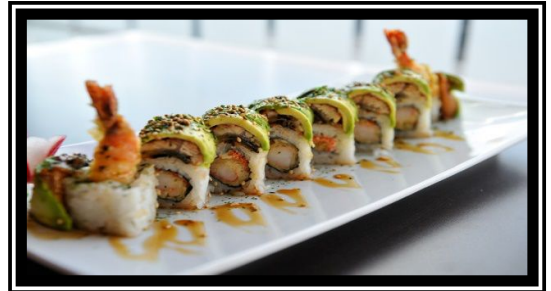
Lion King Roll