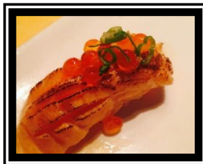
Seared Salmon Belly