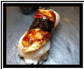
Foie Gras & Scallop