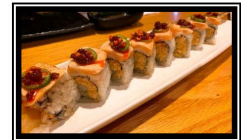
Burning Man Roll