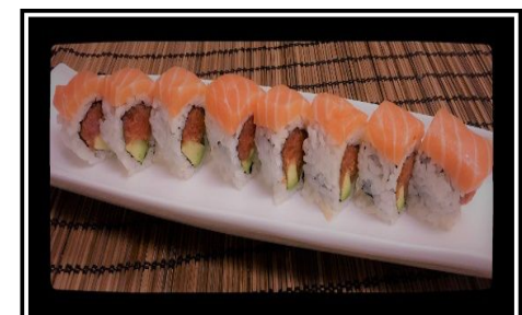
Orange Dragon Roll