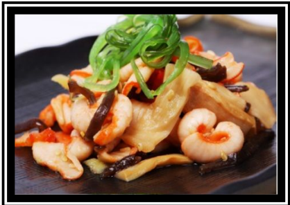
Ika Sansai Salad