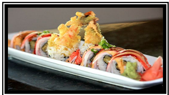
Shaggy Dog Roll