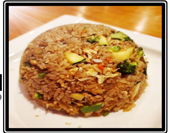
Vegetable Fried Rice