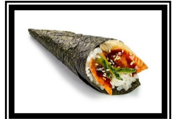
Unagi Hand Roll