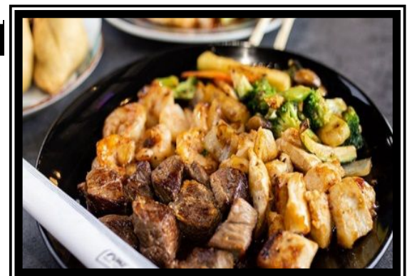
Hibachi Chicken & Steak

*ITEMS MARKED WITH AN ASTERISK* MAY BE SERVED RAW OR UNDERCOOKED;